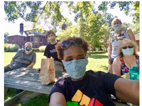
Plein-air EAA Board Meeting