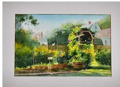
A Sabbath Garden - Kathy Oravec