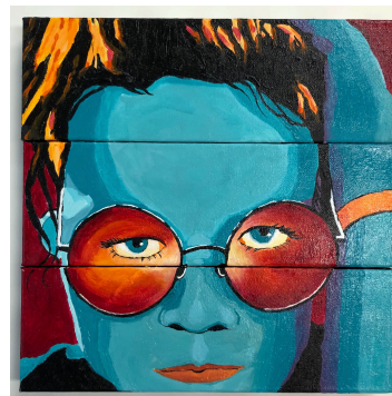
“Pieces of Me” - Acrylic