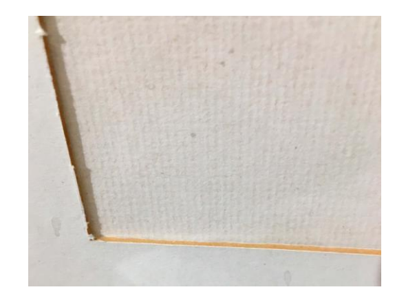
Use mats that are cut improperly