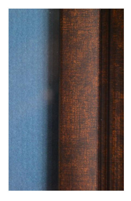
Make sure frame and glass are clean