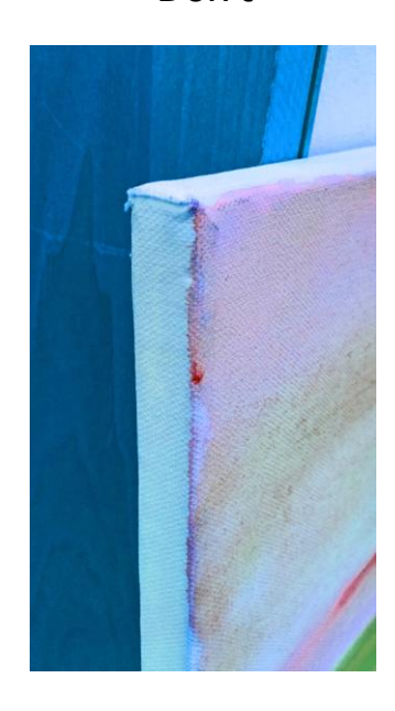
Leave canvas edge unpainted