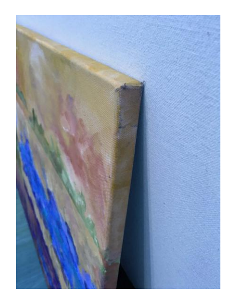
Paint the edges of your canvas