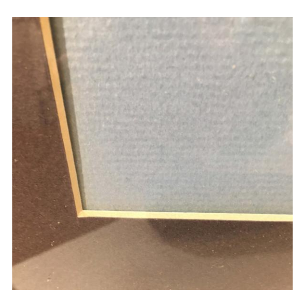
Use yellowed mats