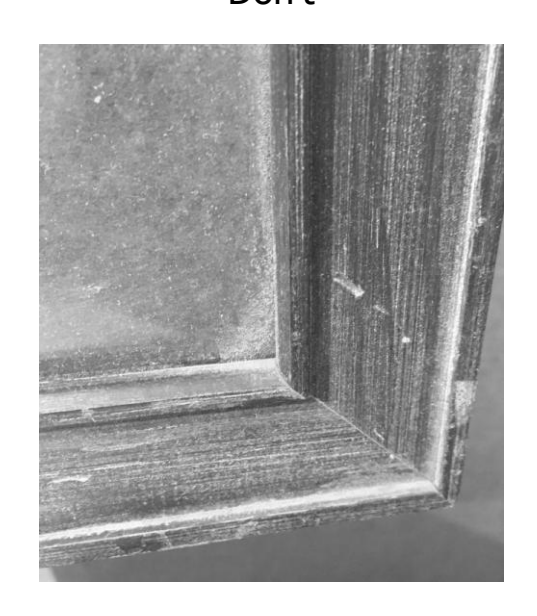
Have dirty glass or frames