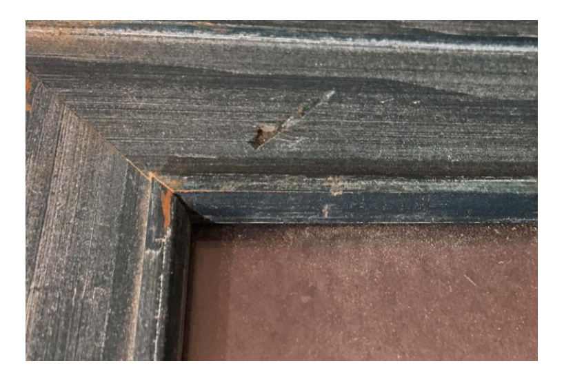
Use chipped or scratched frames

Your frame is the icing on your cake. It should be clean with no imperfections in its surface such as scratches or gouges. It is the final piece of your artwork and its presentation. Although a distressed look may be appropriate for your work.