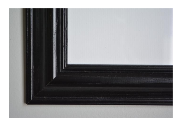
Use a frame with no dents or scratches