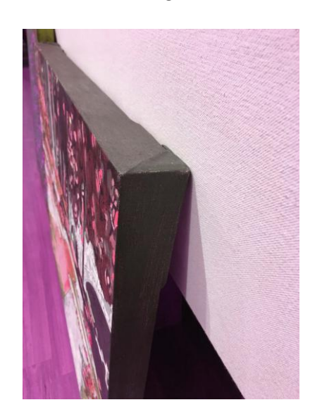
Paint or tape the edges of your canvas. This is a gallery wrapped canvas

A canvas edge should not detract from your painting. The edges need to be finished. You can paint it, frame it with wood, or tape it.