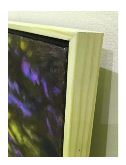
Frame your canvas