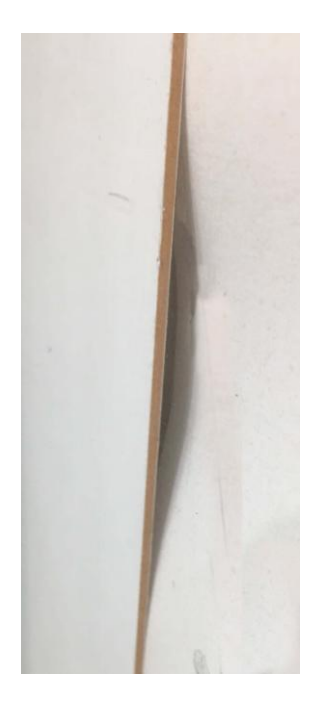
Have warped mats or paintings

Mats are the finishing touch to your paintings. They are a wonderful accent to add to your artwork. They can also draw attention to the bad very quickly. Discolored or dirty mats should be discarded.