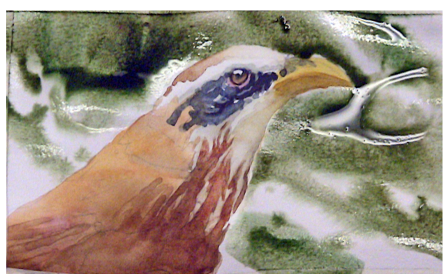
Background - work flat; add a glisten of clean water; drop in Hookers green.