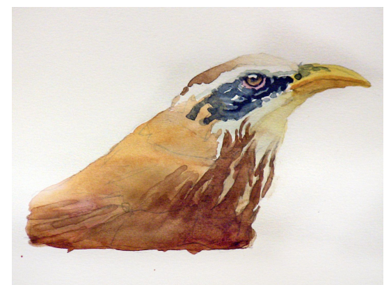
Add the sharp edges as the 2nd layer.