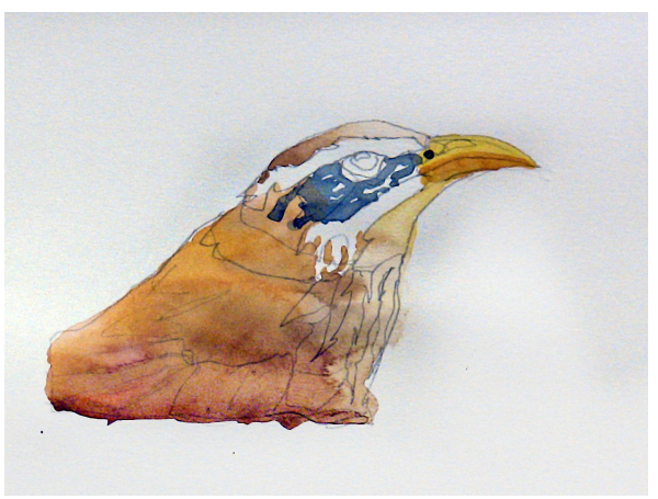
Put in the soft kissed edge blends in 1st layer.