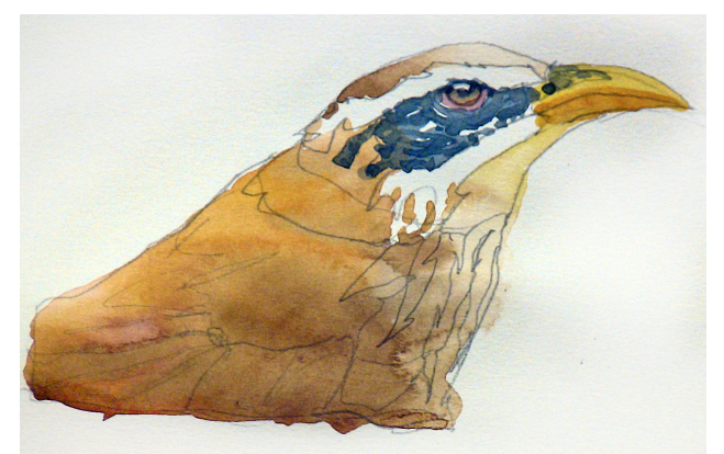
Darkened a little in the upper corners, dropped alizarin crimson around the eye and added neutral tint, as the darkest dark.