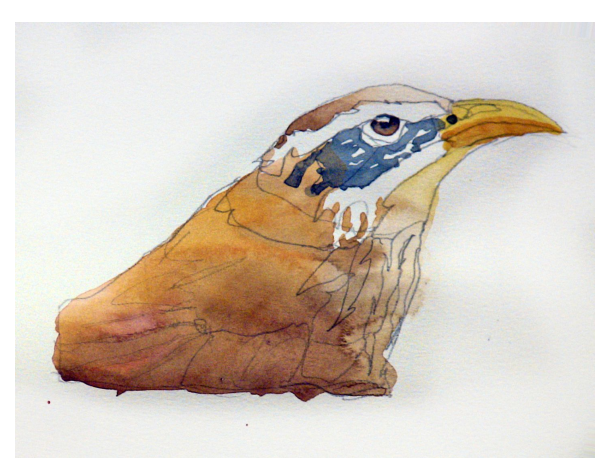
Develop the eye. Paint whole eye with burnt sienna, painting around the reflection. Use Payne's gray as the near darkest dark.