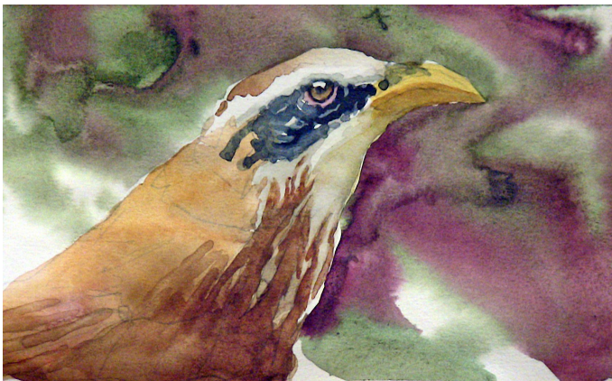
Now drop in burnt sienna, permanent rose. Darken underneath bird's neck.