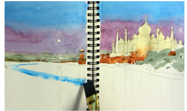
Next, the water.