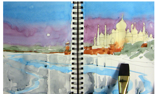
Continue adding water. Leave reflections for the Taj.