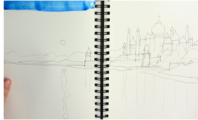
Start with an intense blue wash for sky on left side of sketch.