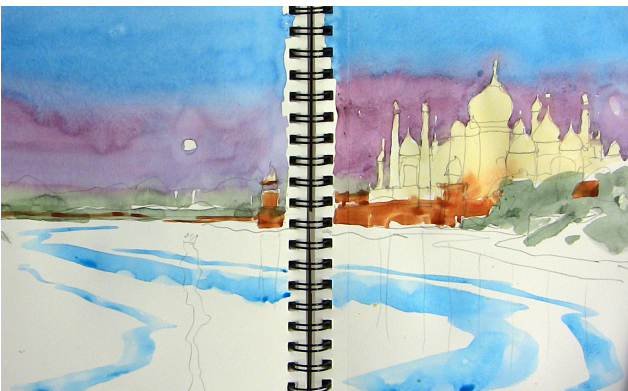
Adding water in a 'S' shape.