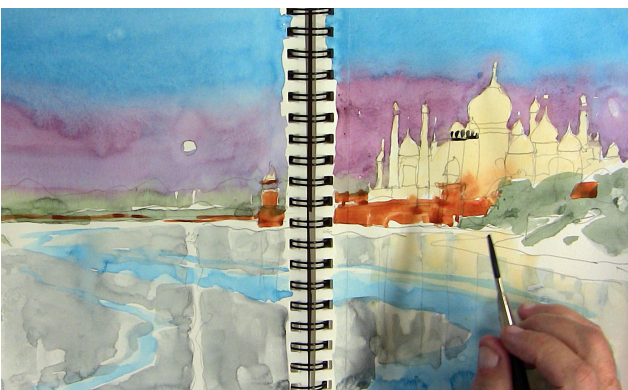
Color in the reflections.