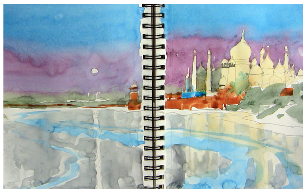
...and continue detailing.