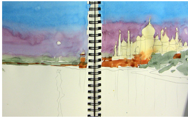
Add a darker brick color to the foreground wall.