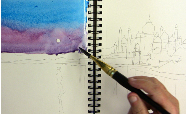
Transition to a purple shade. Cut around the sun.