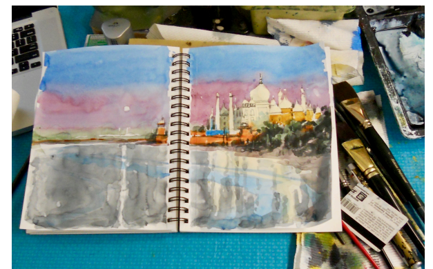
David's final class version.