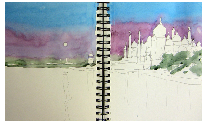
Add green color to foliage on the right.