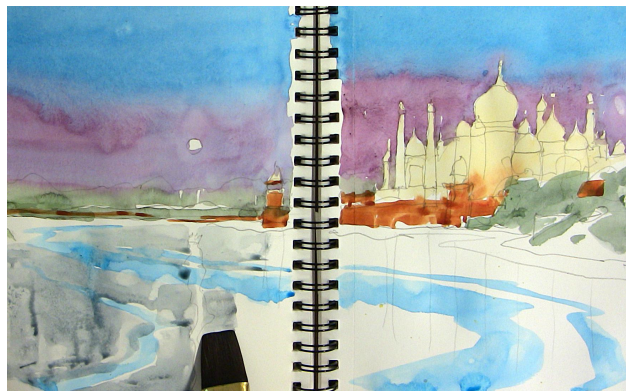
Add more water in Payne's gray, make sure to leave sun's reflection.