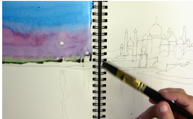
While wet add green for tree line.